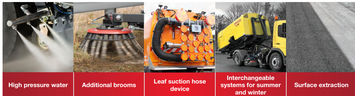
High pressure water

Thanks to our modular system, your machine becomes an unbeatable cleaning professional. Here you will find a small selection of possibilities: